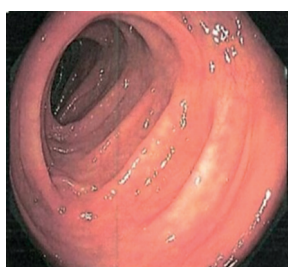
Excellent Bowel Preparation